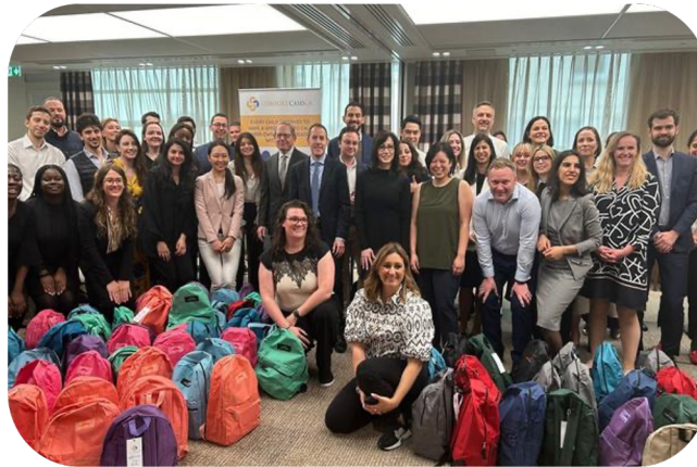
Packing Day at your office for up to 60 people

Minimum Donation £4500 (location dependent)