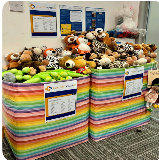
Office Collection Box