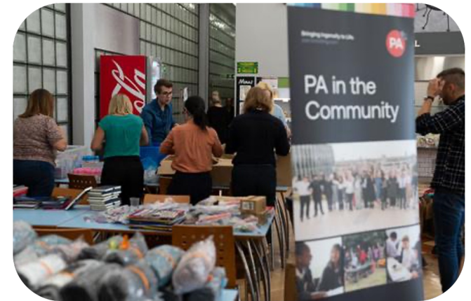
Packing Day for 60-120 people

Minimum Donation £4500 (location dependent)