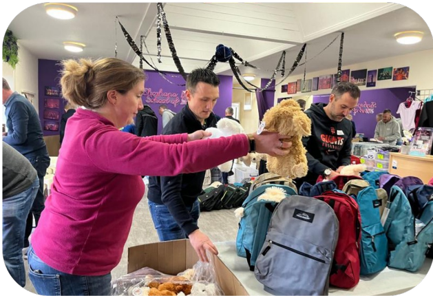
Packing Day at our Hertfordshire Hub for up to 20 people.